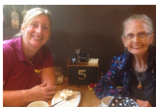
A Time Out co-ordinator with a client